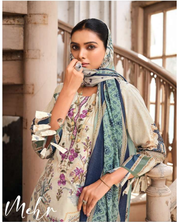
Sweet spring is your which bring a whole new range of variety. 796-001