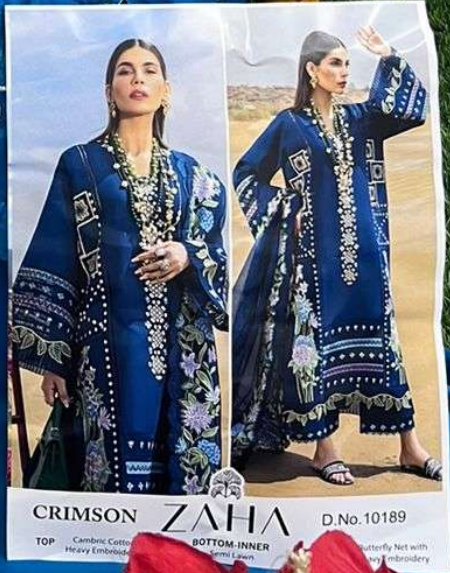
CRIMSON ZAHA D.No. 10189 TOP: Cambelic Cotton Heavy Embroidery BOTTOM-INNER: Polyester Net with Heavy Embroidery