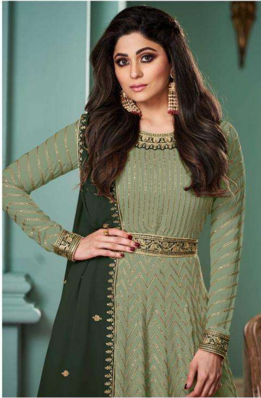
8529 / E