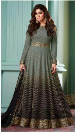
8529 / C