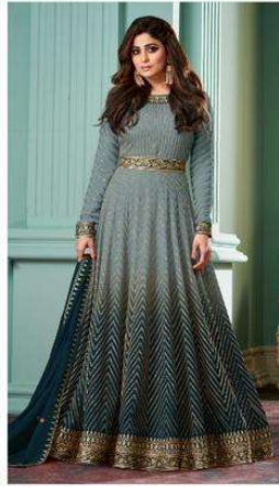
8529 / B