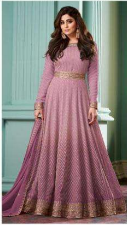
8529 / A