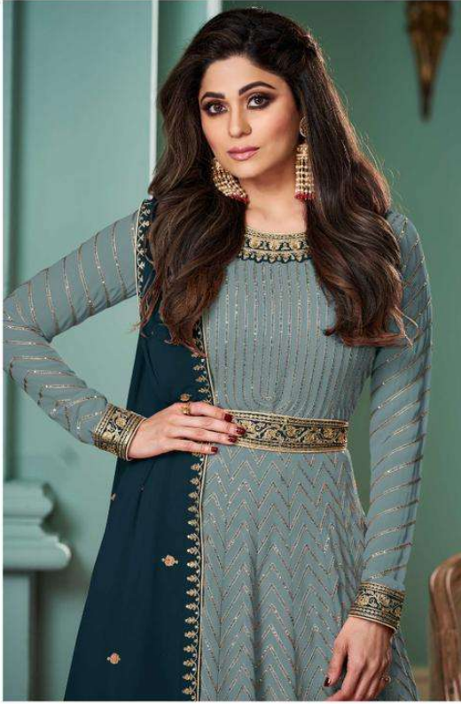
8529 / B