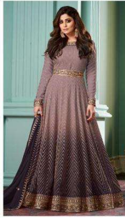
8529 / D