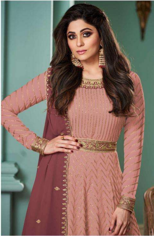
8529 / F