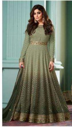
8529 / E