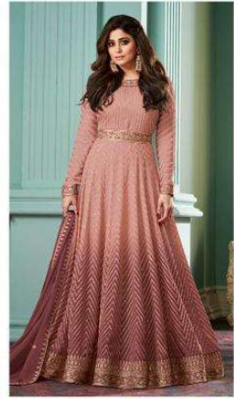
8529 / F