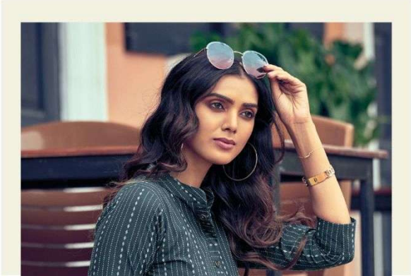
designs that will make you feel amazing