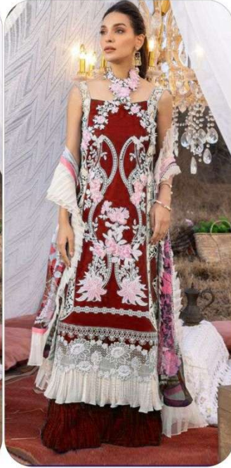
D.No | 224-B