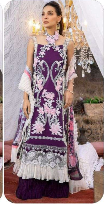
D.No | 224-D