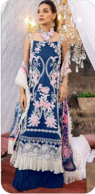
D.No | 224 A