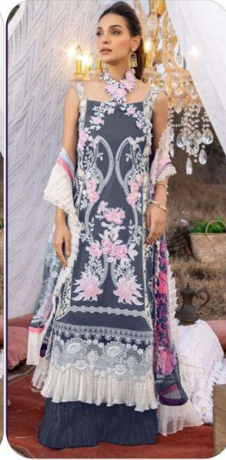
D.No | 224-C