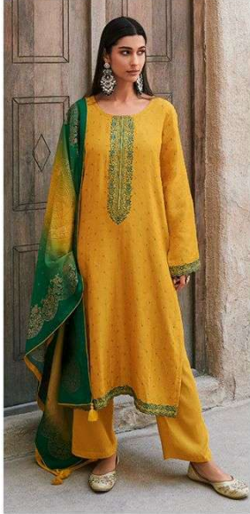
R / 001