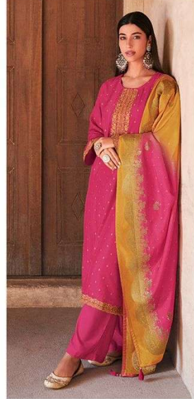
R / 003