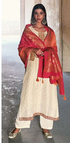
R / 002