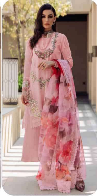
D.No | 202-B