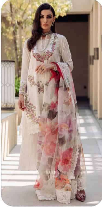
D.No | 202 A