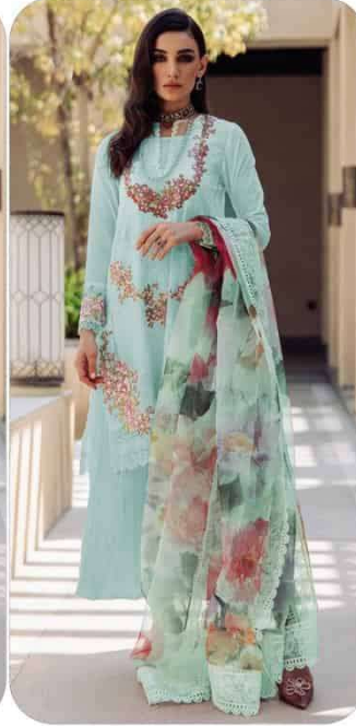
D.No | 202-C