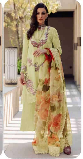
D.No | 202-D