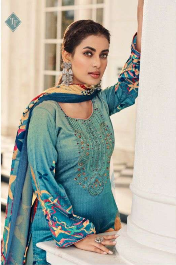
■ 4101 ■ A woven tale of romance in each ensemble. ROYAL ROMANCE