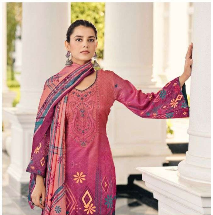
■ 4102 ■ A blissful balance of Indian & contemporary aesthetics. SHEER BLISS