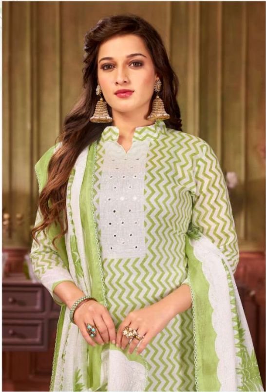
TOP :- PURE COTTON PRINT WITH KHATLI HAND WORK BOTTOM :- PURE COTTON SOLID DYED DUPATTA :- PURE COTTON KOTA CHEX PRINT