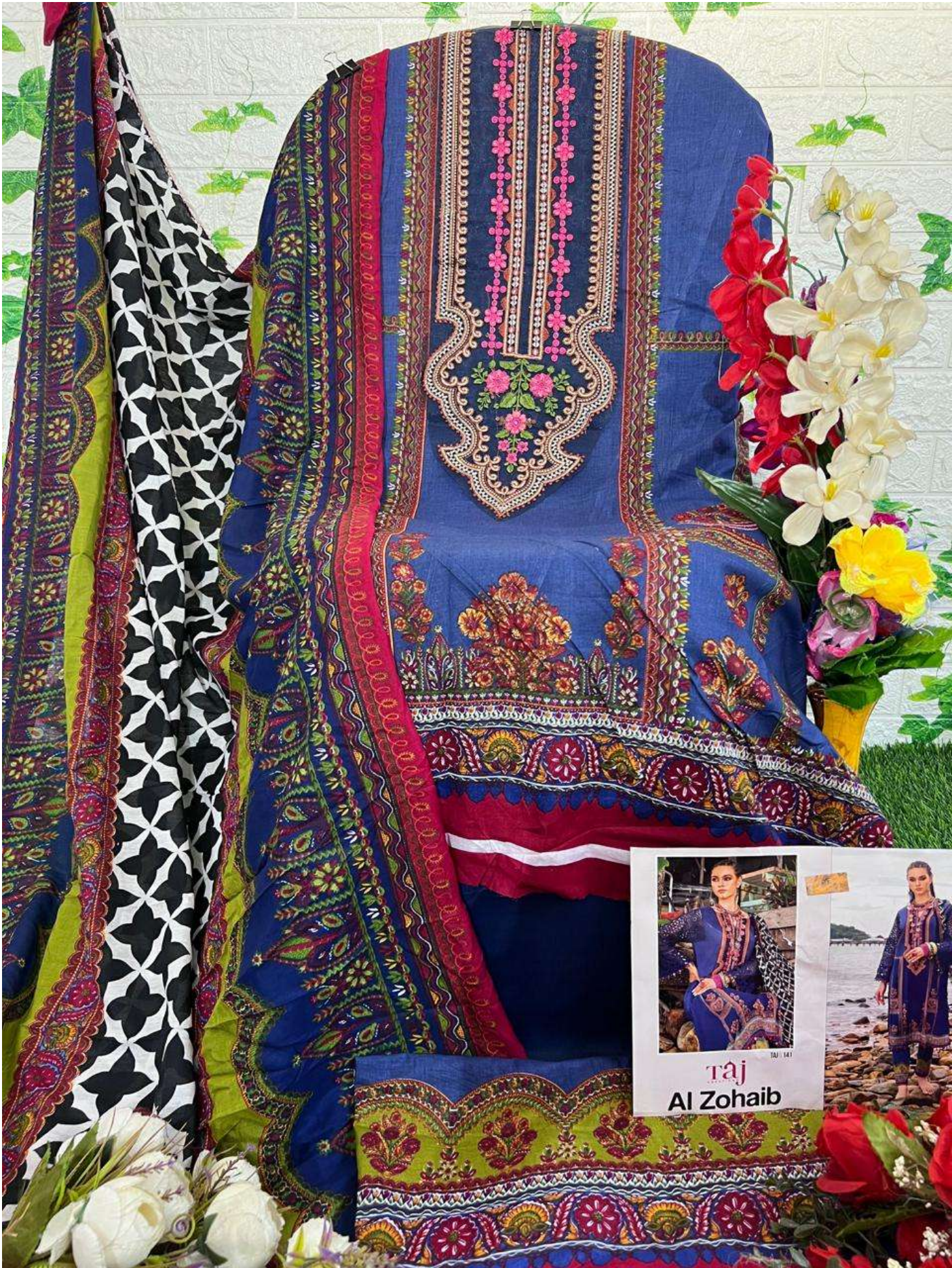
raj Al Zohaib Taj 141