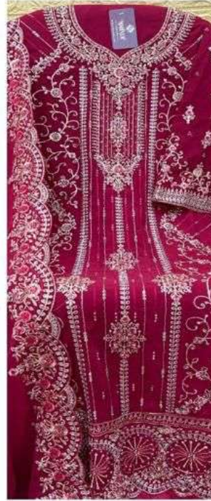
D.NO. - 8003