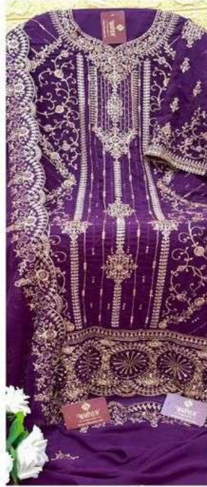
D.NO. - 8002