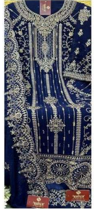
D.NO. - 8004