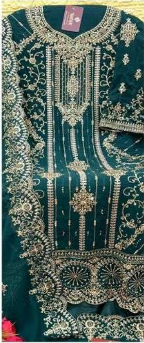
D.NO. - 8001