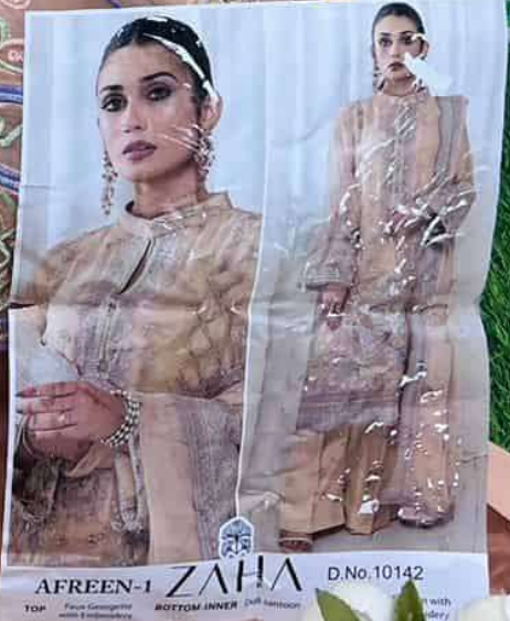
AFREEN-1 ZAHHA D.No.10142 TOP: Fabric: Georgette with Embroidery. BOTTOM INNER: Silk Satin. Embroidery with Gold Thread.