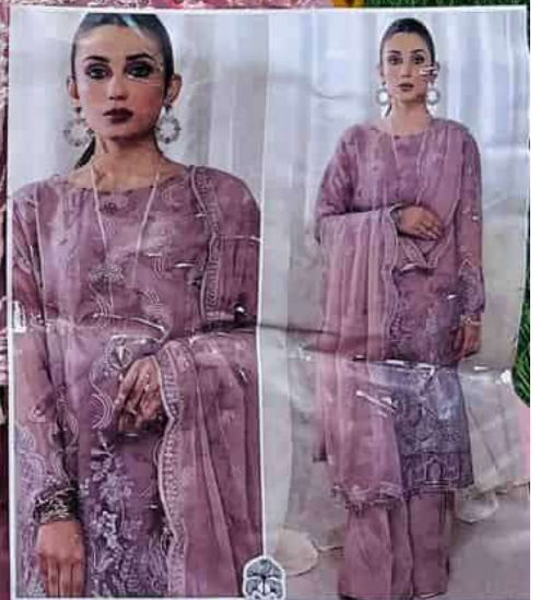
AFREEN-1 ZAHA D.No. 10140 TOP Faux Georgette with Embroidery BOTTOM-INNER Dull Satin Kazran with Embroidery