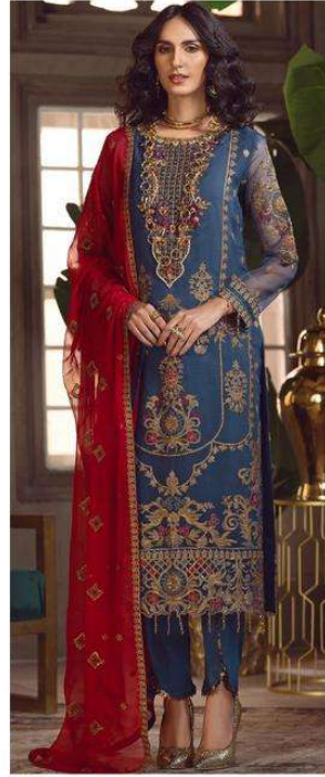
D.NO. - 7002