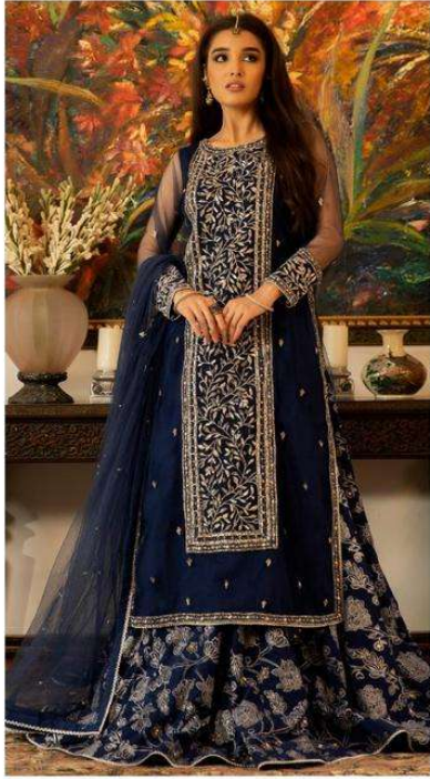
D.NO. - 7001