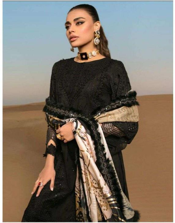
D.NO.154 TOP:-REYON COTTON BOTTOM:-PC COTTON DUPATTA:-TEBI SILK