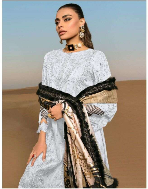
D.NO.154-A TOP:-REYON COTTON BOTTOM:-PC COTTON DUPATTA:-TEBI SILK