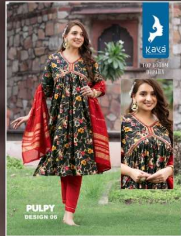
PULPY DESIGN 06