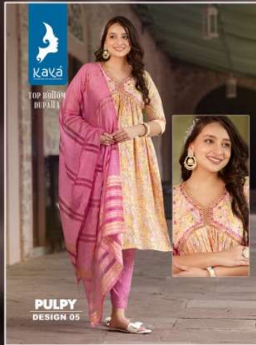
PULPY DESIGN 05