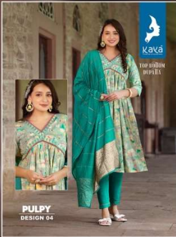
PULPY DESIGN 04