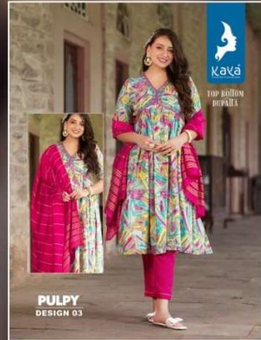
PULPY DESIGN 03