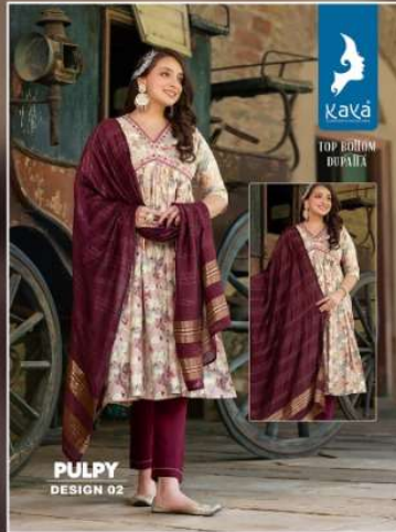
PULPY DESIGN 02