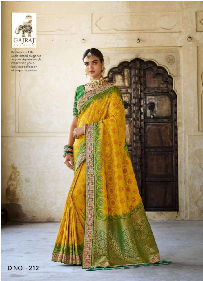
D NO. - 212

Reclaim a subtle, understated elegance as your signature style. Presents to you a fabulous collection of exquisite sarees.