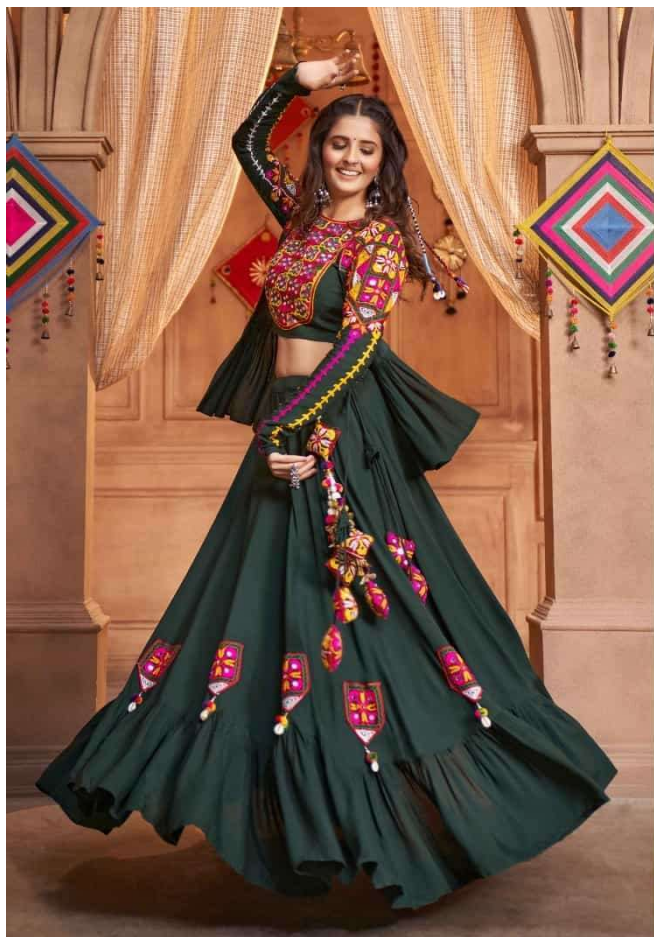
Blasting the Traditional & New 2358