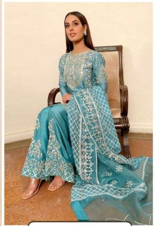
D.NO.116 TOP:- ORGANZA INNER:- SANTOON DUPATTA:- ORGANZA BOTTOM:- SANTOON