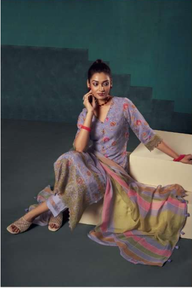
Splendid motifs and grandeur appeal make this set of saris awe-worthy. Get all the ethereal and earthy looks here.