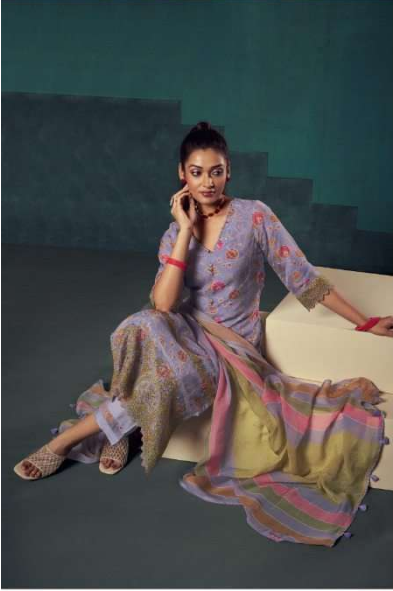
Splendid motifs and grandeur appeal make this silk of saris awe-worthy. Get all the ethereal and earthy looks here.