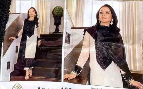
AL AMR Anaya 103 Top : Fox Georgett With Embroidery Bottom : Dull Santoran With Embroidery Patches Inner : Dull Santoran Dupatta : Georgett With Embroidery