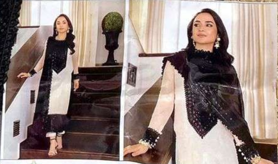
AL AMR Anaya 103 Top : Fox Georgett With Embroidery Bottom : Dull Santoran With Embroidery Patches Inner : Dull Santoran Dupatta : Georgett With Embroidery