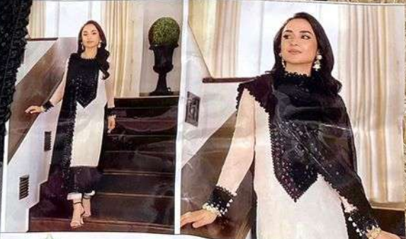
AL AMR Anaya 103 Top : Fox Georgett With Embroidery Bottom : Dull Santolina With Embroidery Patches Inner : Dull Santolina Dupatta : Georgett With Embroidery