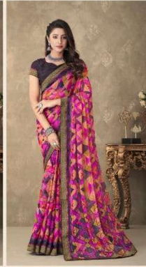
24003 - A