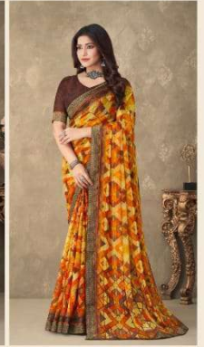
24003 - B