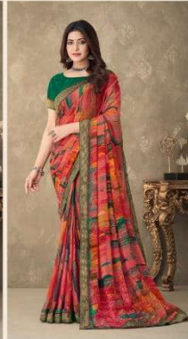
24005 - A