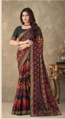
24001 - B