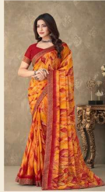
24002 - B