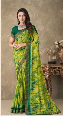
24002 - A