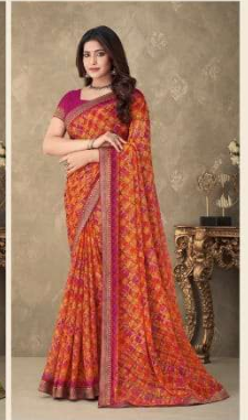
24006 - B