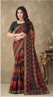
24001 - B