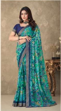
24004 - A