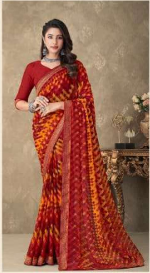
24001 - A