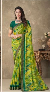
24002 - A