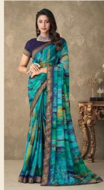
24005 - B