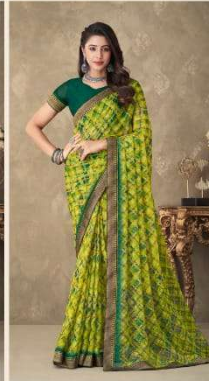
24006 - A