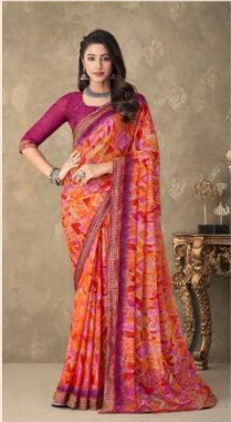
24004 - B