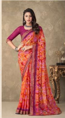
24004 - B