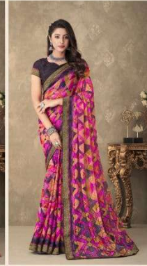
24003 - A