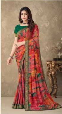
24005 - A