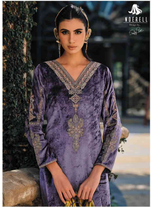
■ ■ ■ IRON HAND IN A VELVET GLOVE 10373