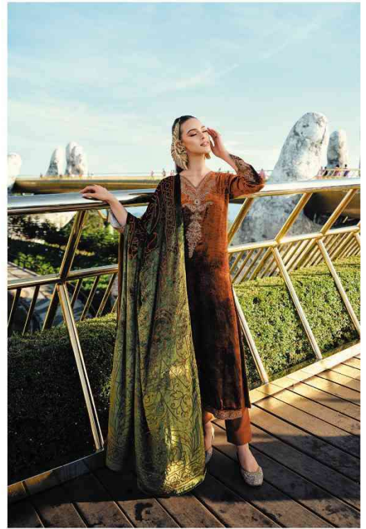
■ ■ ■ SOFTER THAN SATIN WAS THE LIGHT 10372