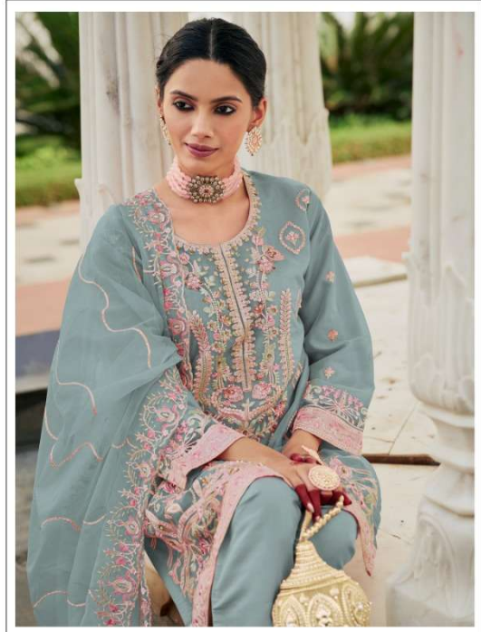
MR -122 B