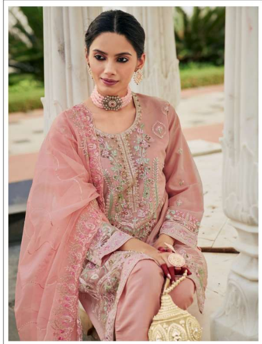
MR -122 A