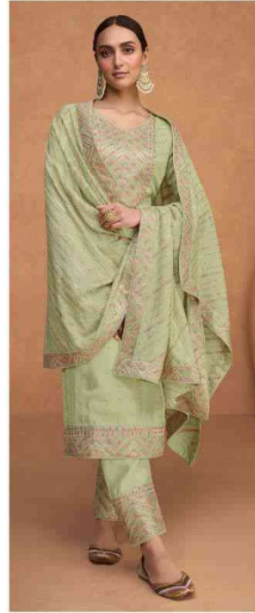
D.NO - 9502