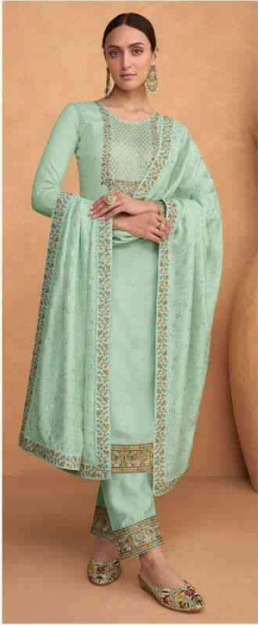
D.NO - 9500