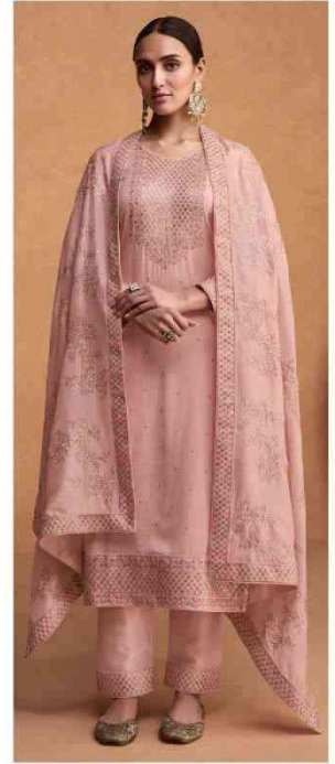
D.NO - 9503