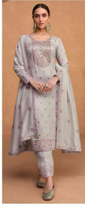
D.NO - 9501