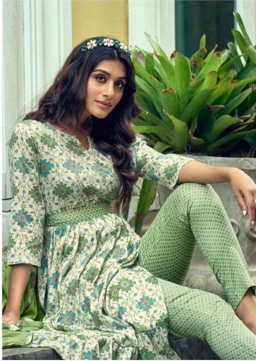
UPDATE PASTE STYLE