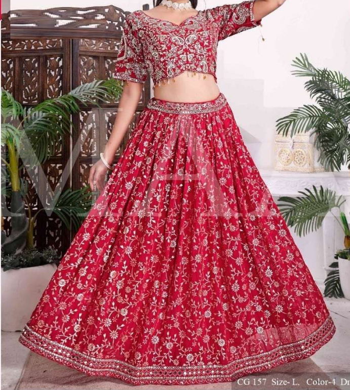
CG 157 Size- L. Color-4 Dno-324.69.115.jpg