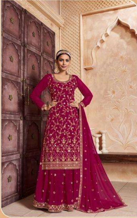
Suits in dark-Hues with 'Embroidered works Statement Julis for a 'Modern and Graceful 'Indian 'Ailire.'