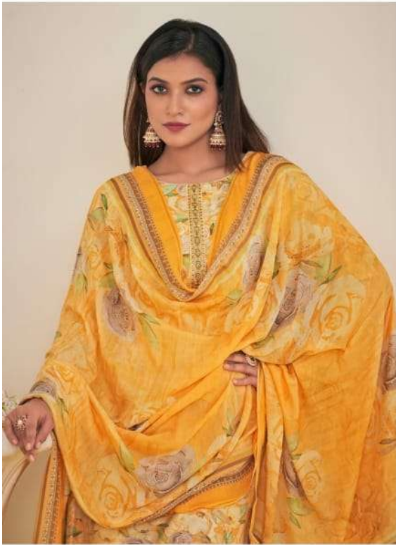
THE QUEEN OF TEXTILES | 147