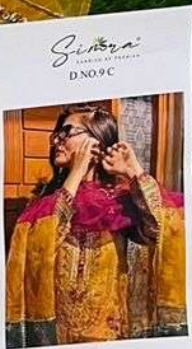
TOP - ORGANZA HEAVY EMBROIDERY WORK BOTTOM - HEAVY SANDOON WITH BOTTOM PECHA WORK SAPUNGA - ORGANZA WITH HEAVY EMBROIDERY WORK