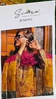
TOP - ORGANZA HEAVY EMBROIDERY WORK BOTTOM - HEAVY SANDOON WITH BOTTOM PECHA WORK SAPUNGA - ORGANZA WITH HEAVY EMBROIDERY WORK