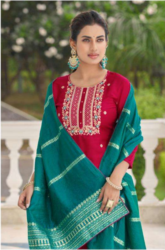
Embrace the grace this season while you adorn this spectacular piece from the collection. 01