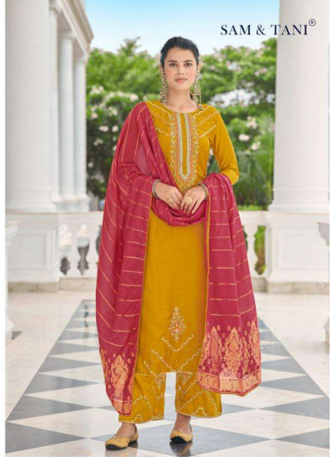
Evoke your ethnic ethos with this beautifully crafted dress with embroidery details. 02