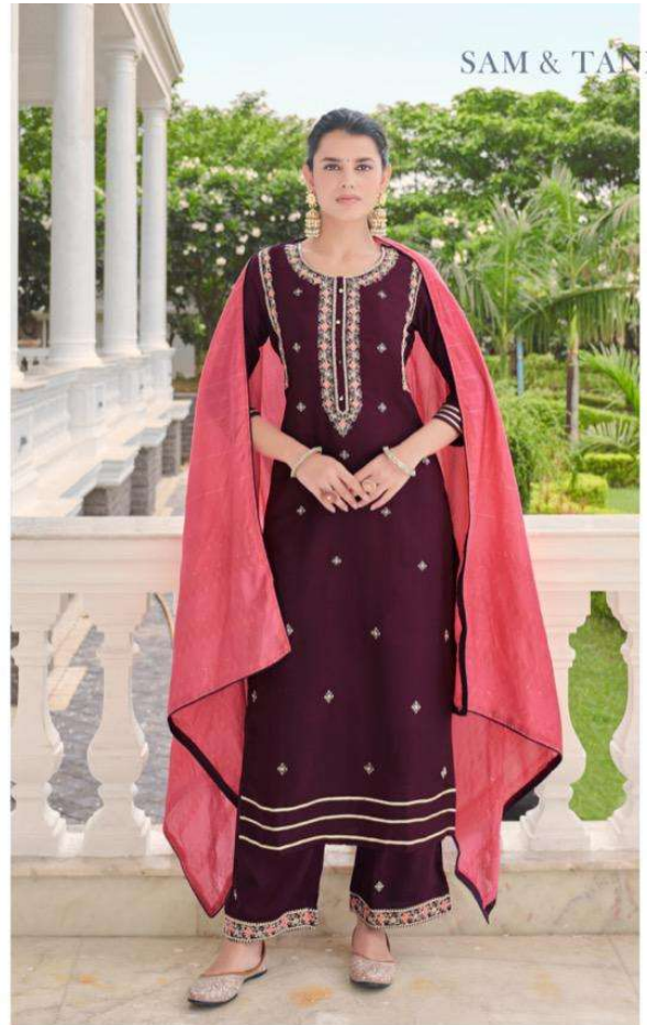
brings to you elegant & unique effortless style that perfectly blends with the trends of the season.