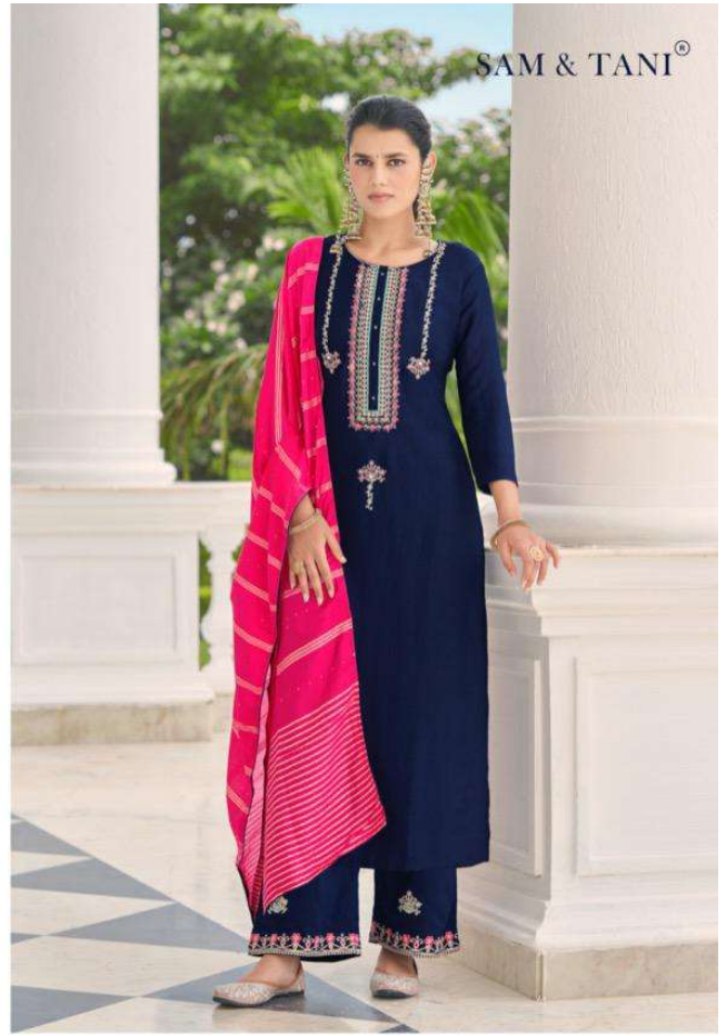
Redefine your style with latest trends to get a mesmerizing look when you head to a special occasion.