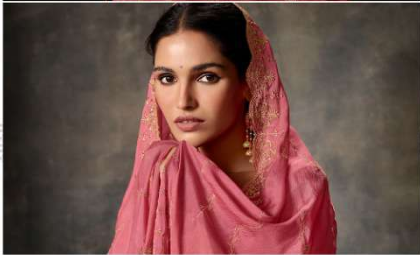
The art of being graceful D.NO.14872