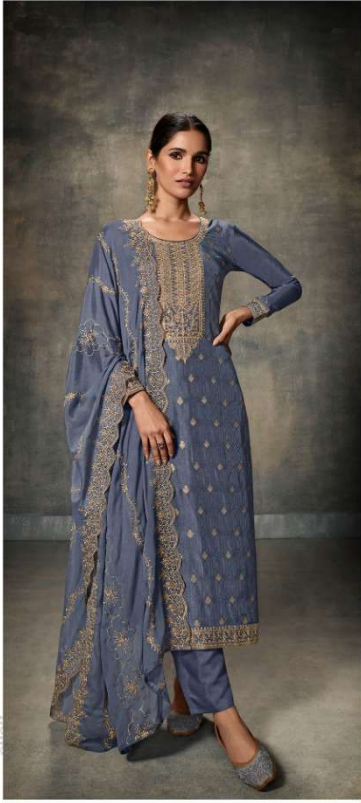
Brighten up your festive mood D.NO.14873