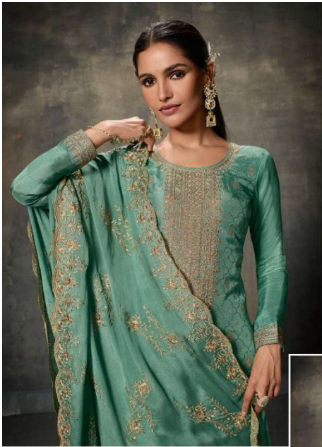
Embrace elegance and poise. D.NO. 14871