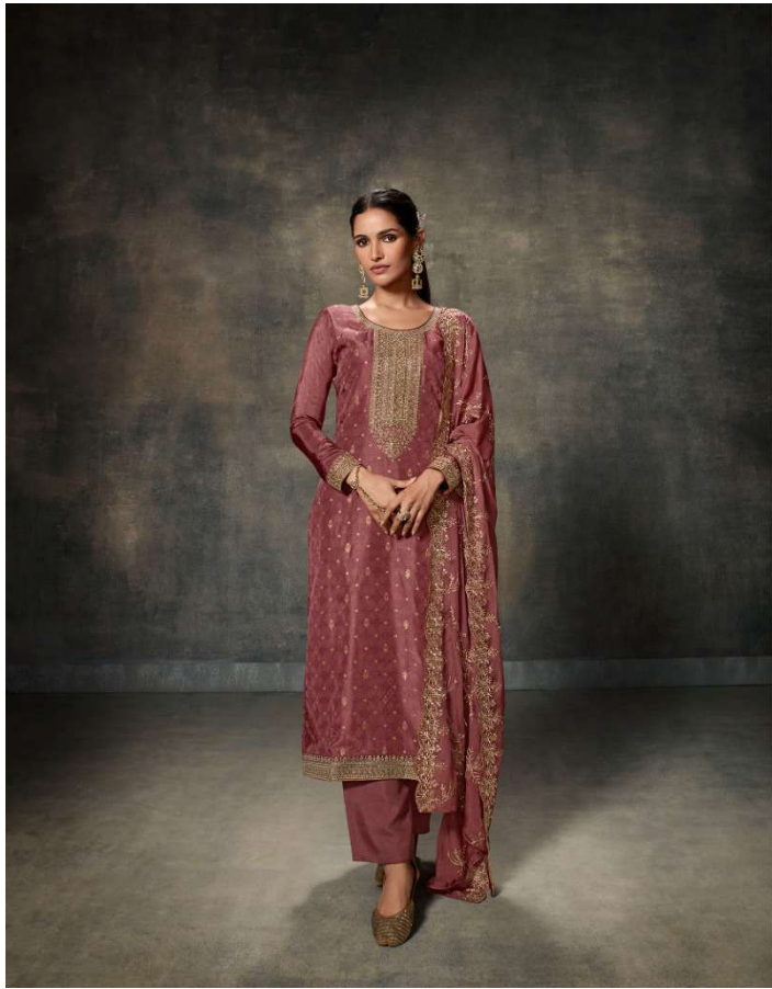
Set your own fashion goals D.NO. 14875