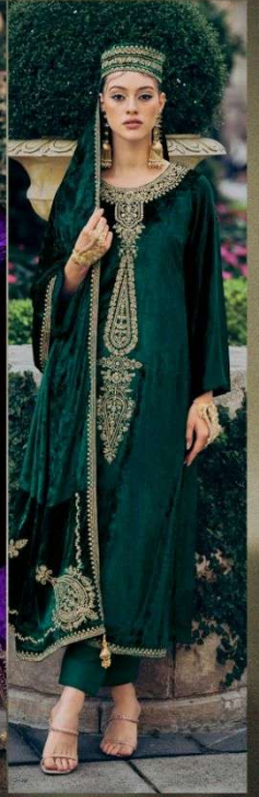
FOCUS : 10434