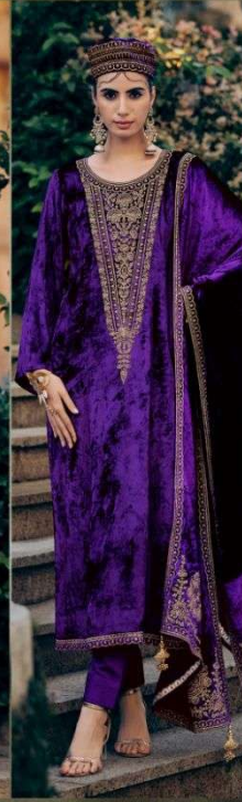
FOCUS : 10433