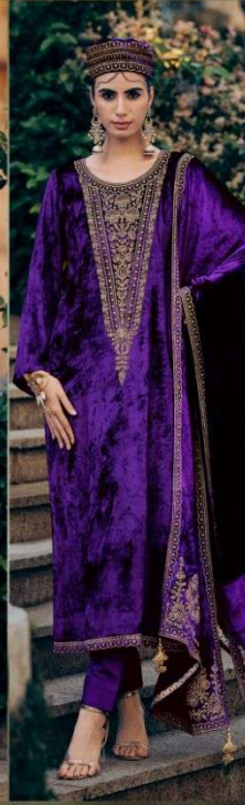
FOCUS : 10433