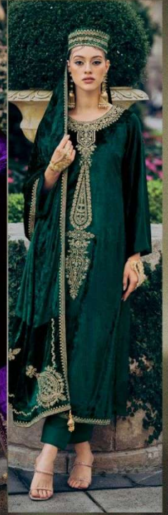
FOCUS : 10434