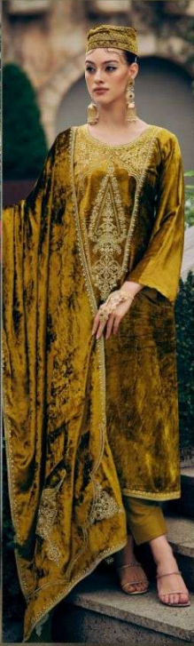
FOCUS : 10430