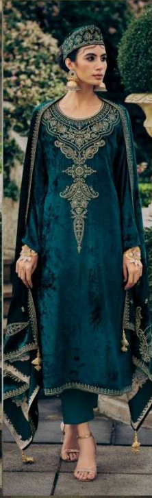
FOCUS : 10431