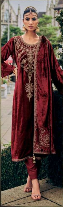
FOCUS : 10429