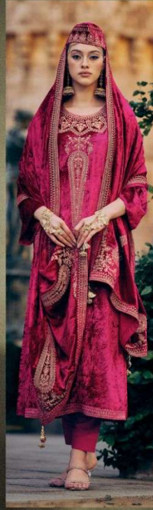
FOCUS : 10432