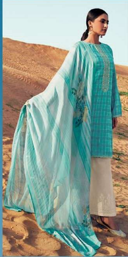
M K = 0 2