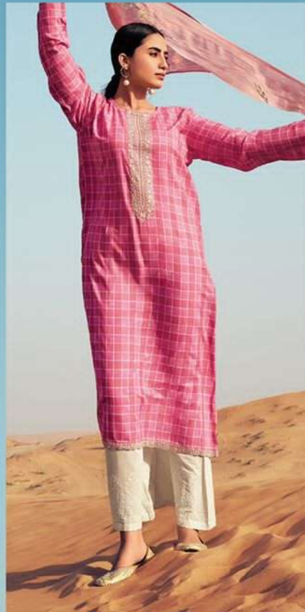
M K = 0 4