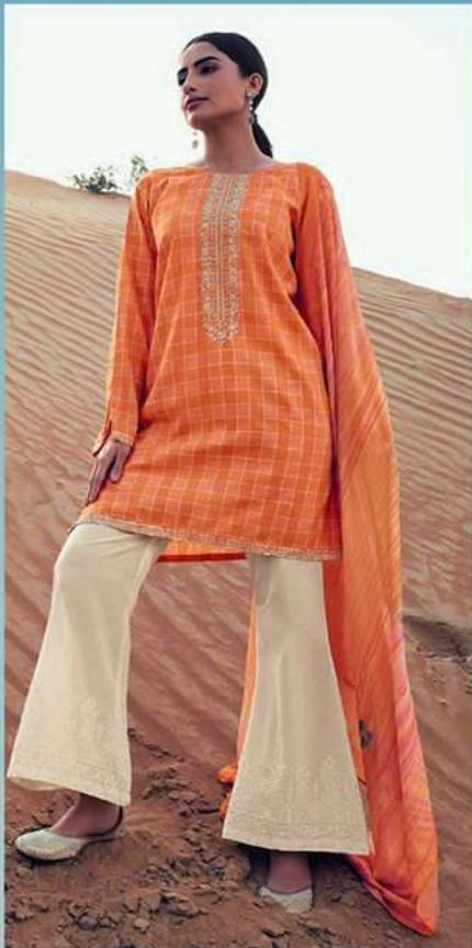
M K = 0 3