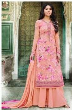
D.NO. :- 995