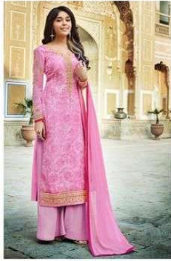
D.NO. :- 991