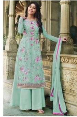
D.NO. :- 993