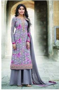
D.NO. :- 992