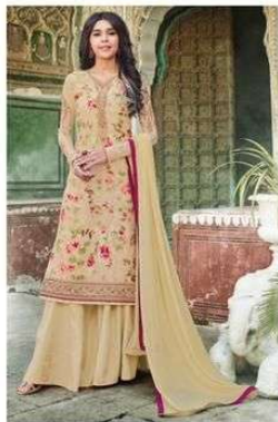
D.NO. :- 996