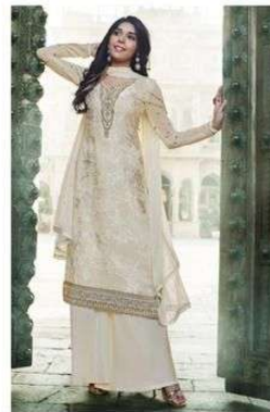
D.NO. :- 997