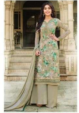
D.NO. :- 994