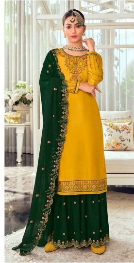
+ 893 +