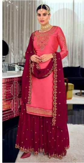
+ 892 +