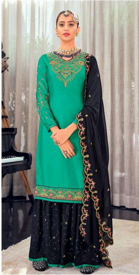
+ 891 +