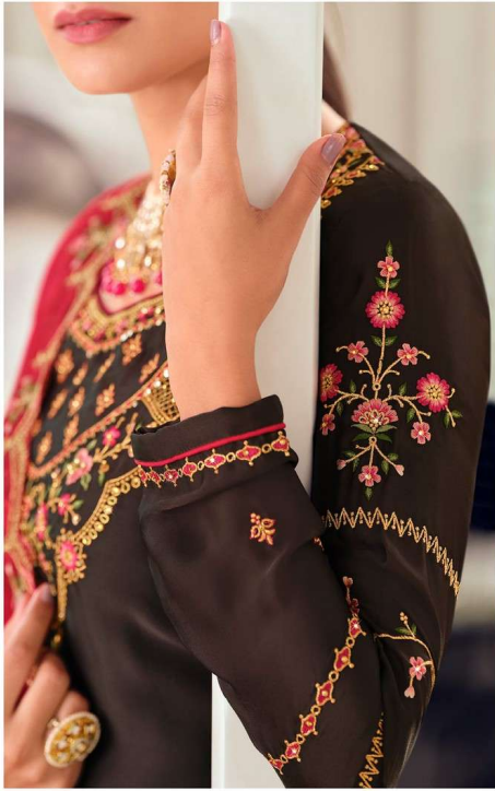
ELEGANT EMBROIDERED CONTRAST ENSEMBLE