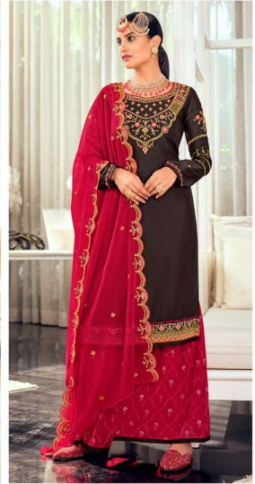
+ 894 +