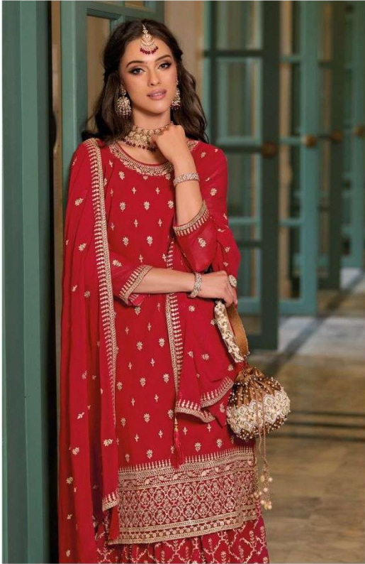
1614 ● CURIOUS STAY INSPIRED