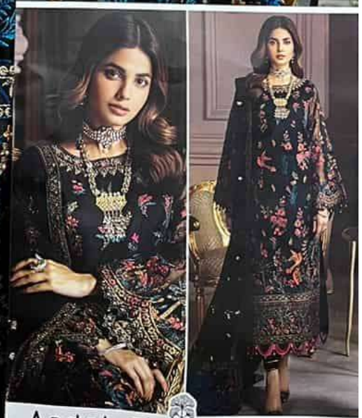
Aadab ZAHΛ D.No.10205 TOP Faux Georgette with Embroidery BOTTOM-INNER Dull Satin DUPATTA Nazmi with Embroidery