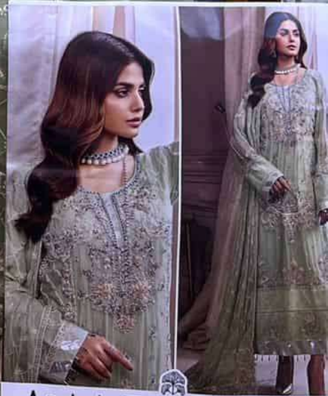
Aadab ZAHRA D.No.10204 Vol-1 TOP: Faux Georgette with Embroidery BOTTOM-INNER: DUPATTA: Nazmin with Embroidery