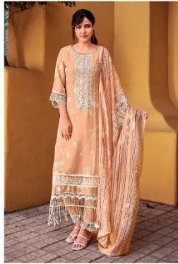
KH • 7964