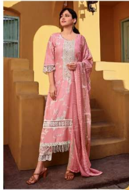
KH • 7967