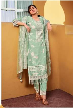
KH • 7963