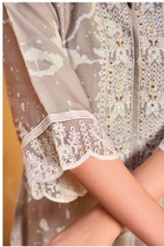
KH • 7962 This season is giving to be bright & colorful