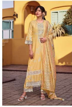
KH • 7966