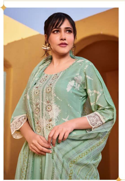
Elegance & sophistication create a charming symphony