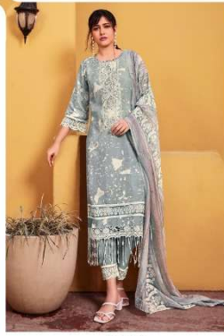
KH • 7965