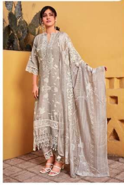
KH • 7962