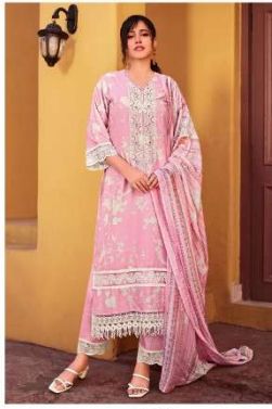
KH • 7961