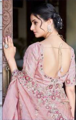
D.No.10009 Fabric Goldie Laheriya Play Style with a Grace