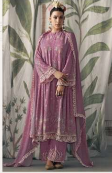
| 9221 |