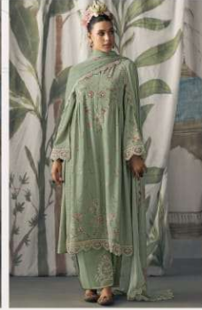
| 9224 |