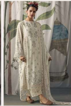
| 9228 |