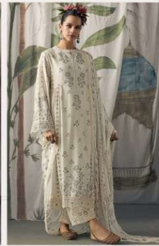
| 9228 |