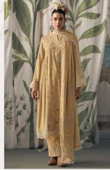
| 9223 |