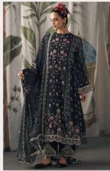
| 9226 |