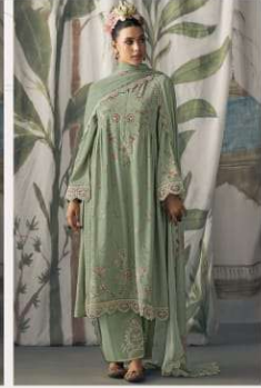
| 9224 |