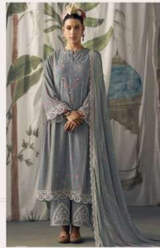
| 9227 |