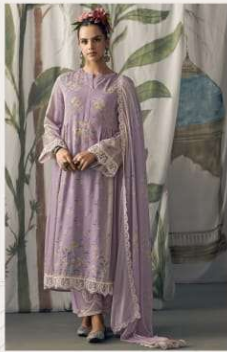
| 9225 |