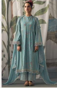
| 9222 |