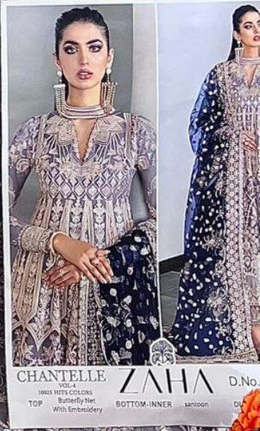
CHANTELLE VOL. 4 D.No. 10005 HITE'S COLORS TOP Butterfly Net With Embroidery ZAHA BOTTOM-INNER saratoon