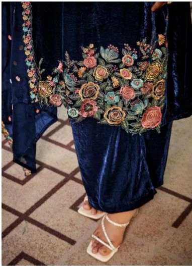
VELVET SERENADE ENSEMBLE