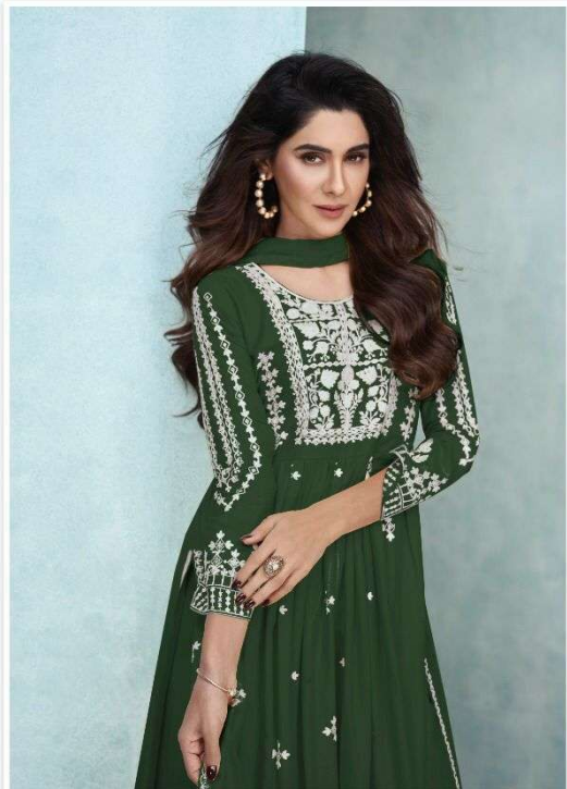
❖ 1105-D ❖