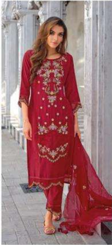
DE . 1081