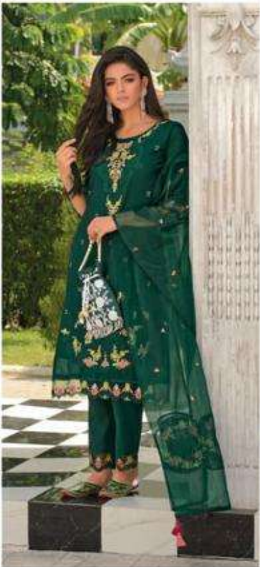
DE . 1084