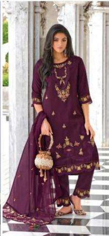
DE . 1086