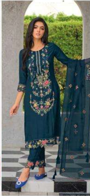
DE . 1082