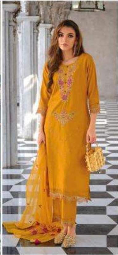
DE . 1083