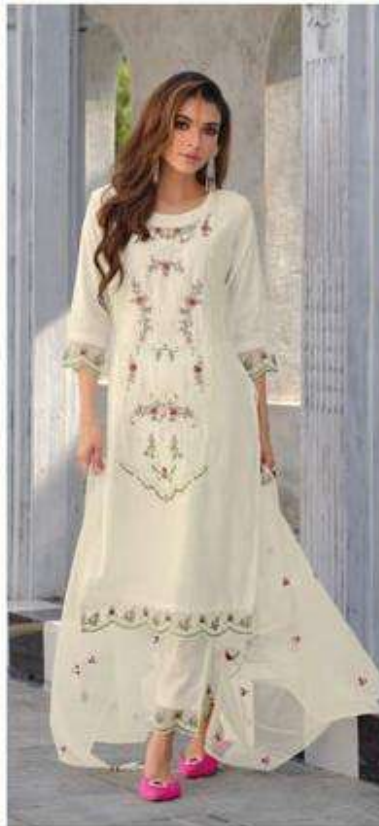
DE . 1085