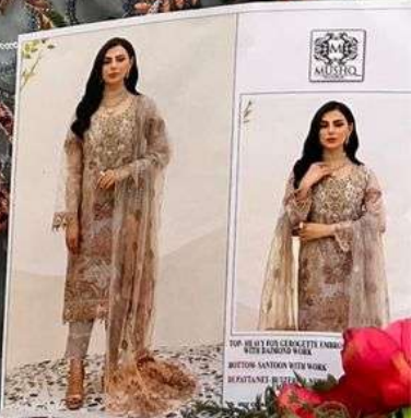
TOP HEAVY AND GENUINELY EMBROIDERED WITH BARBADO WIFE. BOUTIQUE SANDRAN WITH WORK. RESISTANT EMBROIDERY.