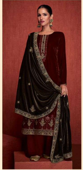
Najakat -E- Leeba -1004