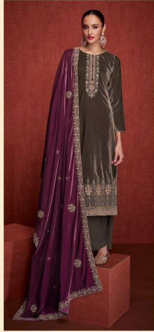
Najakat -E- Leeba -1003