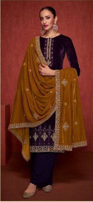
Najakat -E- Leeba -1001