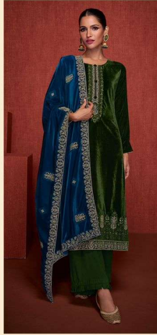
Najakat -E- Leeba -1002