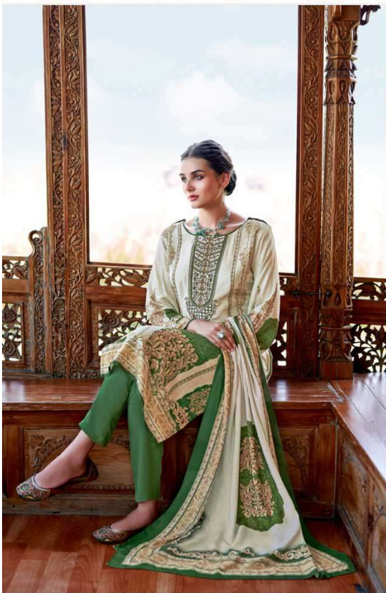
Nourishing unbelievable Crafts with freshness in styling for Perfect charming appearance of you. This splendid piece of fusion, perfectly immaculate your personality.