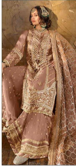
S - 123 B