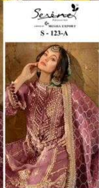
Top - Organza heavy embroidered with diamond work Lower T D: Heavy satin Bottom - Organza heavy embroidered with diamond Dupatta / Organza heavy embroidered with fine side lace