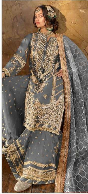
S - 123 C