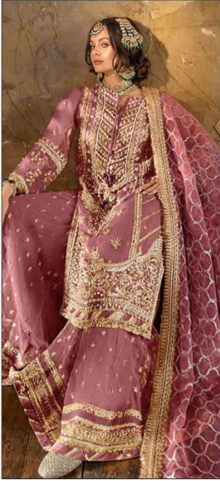
S - 123 A

Top : Organza heavy embroidered with daimond work Inner T/B : Heavy santoon Bottom : Organza heavy embroidered with daimond Dupatta : Organza heavy embroidered with four side lace