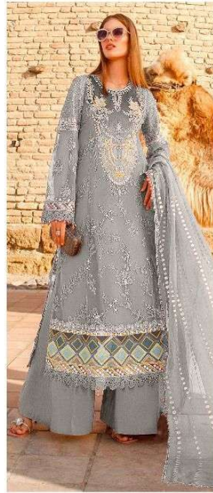
C -1343 C