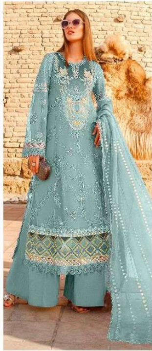
C -1343 B