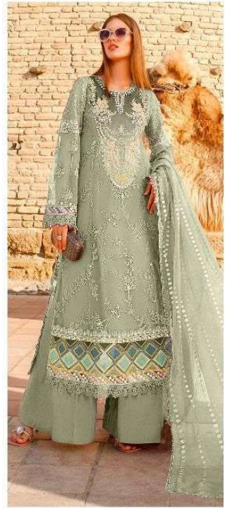
C -1343 D