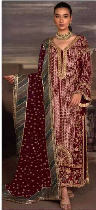
S - 114 B