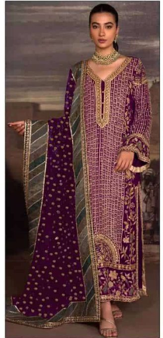
S - 114 D