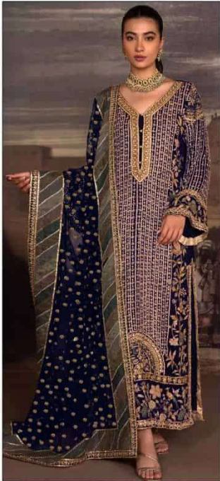
S - 114 A

DUPATTA - NAZNIN EMBROIDERY WORK WITH LACE WORK