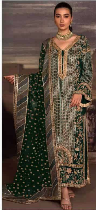
S - 114 C